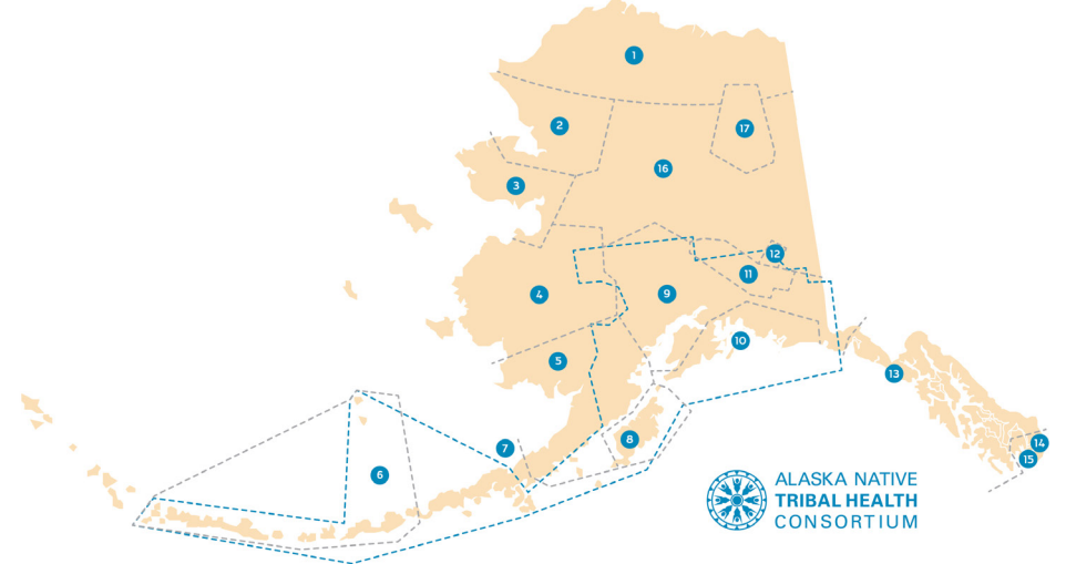
Figure 1: Alaska Health System Map

The action planning process included participants representing eight regions of the Alaska Native Health System (see Figure 1):