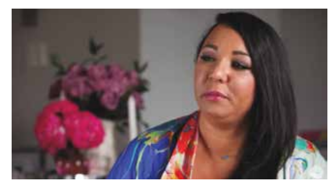
A Two-Spirit Journey: Finding Identity Through Indigenous Cultures (United Way Ottawa, 2017): https://www.youtube.com/watch?v=LLmrBGrUy-w

Two-Spirit Definition: Two-Spirit refers to a gender role believed to be common among most, if not all, Al/AN people, one that had a proper and accepted place within our societies. This acceptance was rooted in teachings that say all life is sacred.<sup>26</sup>