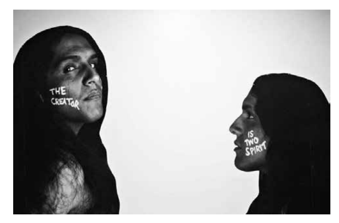
The Creator is Two Spirit by Ryan Young.

Ryan Young's current work focuses on empowering Two-Spirit people, using a variety of mediums, including photography, silkscreen printing, projection and mixed media. The statements used in each piece are constructed to connect gender/sexuality to Indigenous culture; while also recognizing homophobia and transphobia as tools of colonization, which keeps Queer and Two-Spirit people from building and maintaining strong connections to their culture and their communities.