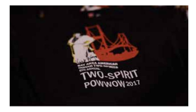
SAN FRANCISCO TWO-SPIRIT POWWOW (WILBUR, 2017):

https://www.youtube.com/watch?v=A4lBibGzUnE&t=3s