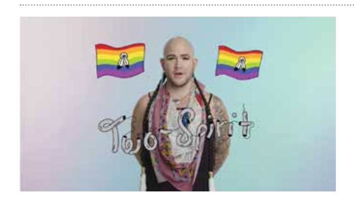
WHAT DOES "TWO-SPIRIT" MEAN? (THEM, 2018):

Two-Spirit is a collective of AI/AN people who use traditional knowledge to understand their spiritual grounding, gender roles, and gender expressions in their community. Today, a person may also be part of the Two-Spirit collective if they are AI/AN and identify in the broader LGBTQIA+ community. Not all Two-Spirit people are LGBTQIA+, and not all Native LGBTQIA+ people are Two-Spirit. Slight confusion? That's ok. Let's further explore by listening to stories and perspectives from Two-Spirit relatives.